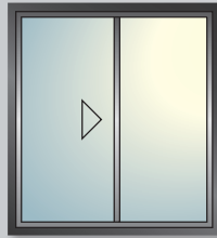
DesignerLine® (Deluxe Frame) Sliding window

DesignerLine® note: Other sizes and configurations in DesignerLine® are available on request, please refer to your local sales office for more information.